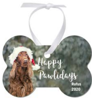
#4857 Dog Bone Ornament with White Ribbon