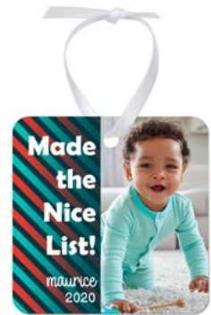
#4859 Square Ornament with White Ribbon