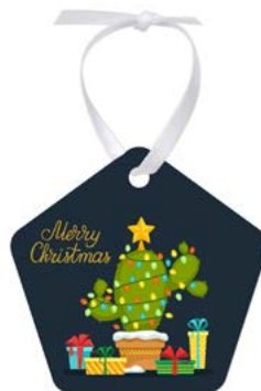
#4858 Pentagon Ornament with White Ribbon