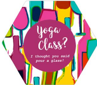
#4889 Hexagon Coaster with Cork Back